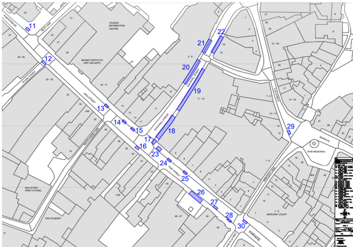
Zone C - High Street, Guildhall Street, Stour Street and Sun Street