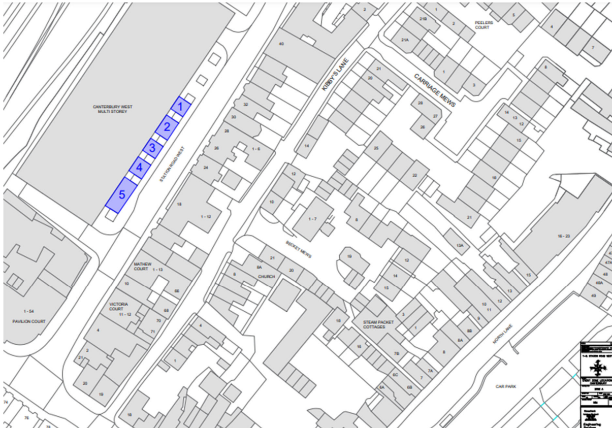
Zone A - Station Road West

Maps showing the proposed street trading pitches are shown below: